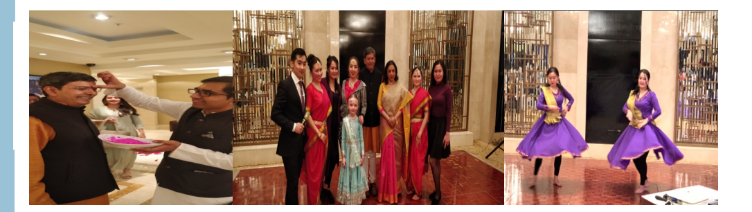
ICCR Foundation Day Celebrations

Tel. Phone: + 7 7172-925700/925701 Fax: + 7 7172-925716 E-mail: info.astana@mea.gov.in